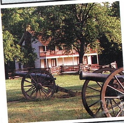
Pea Ridge National Military Park

The Battle of Pea Ridge marked the successful end of a campaign to secure the upper reaches of the Missouri and Mississippi Rivers, and to keep the State of Missouri under Federal control.