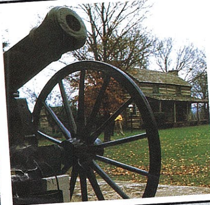
Prairie Grove Battlefield State Park

The battle occurred on two separate battlefields: Leetown and Elkhorn Tavern. Leetown was a decisive Union Victory, and resulted in the deaths of two Confederate Generals and the capture of the ranking Division Commander. Elkhorn Tavern ended when the Confederate forces retreated under heavy Union artillery bombardment.